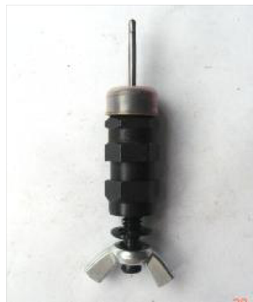
< METRIC >