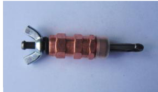
< FRACTIONAL >

Hand operated fasteners for structures requiring limited fastening or limited access. Clamping forces are operator controlled and can range from 50 pounds to 300 pounds